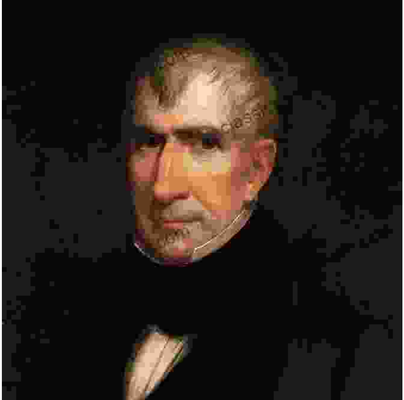
William Henry Harrison during his brief presidency

In 1840, Harrison secured the Whig Party's presidential nomination. His campaign, known as the "Log Cabin and Hard Cider" campaign, exploited his frontier image and populist appeal. Harrison's victory marked a major political upset, as he defeated the incumbent President, Martin Van Buren.