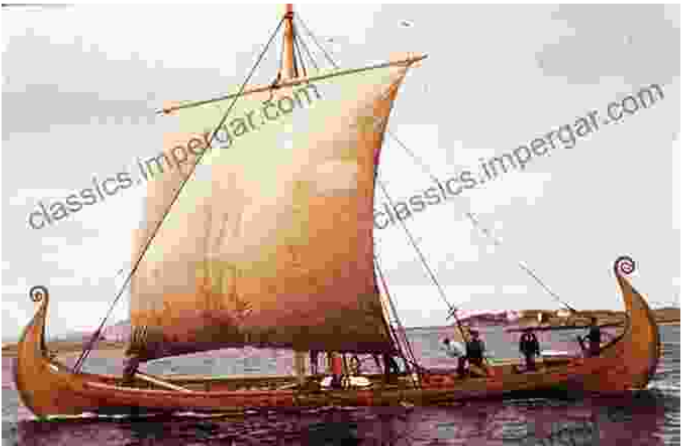
Image: Reconstruction of a Viking longship

Don't miss out on this opportunity to explore the legendary world of the Vikings and uncover their enduring legacy.